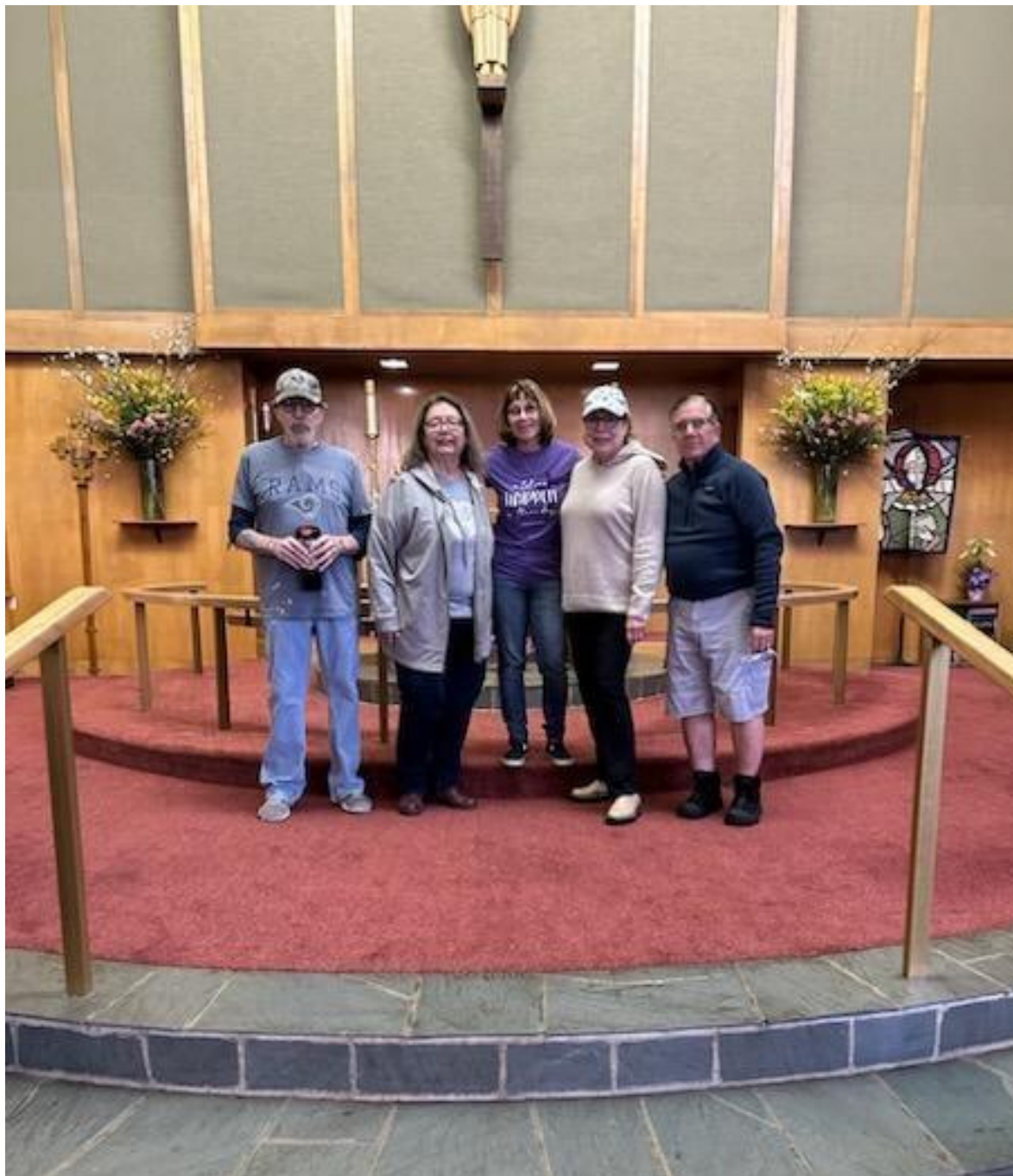
Some of the Altar Guild Angels