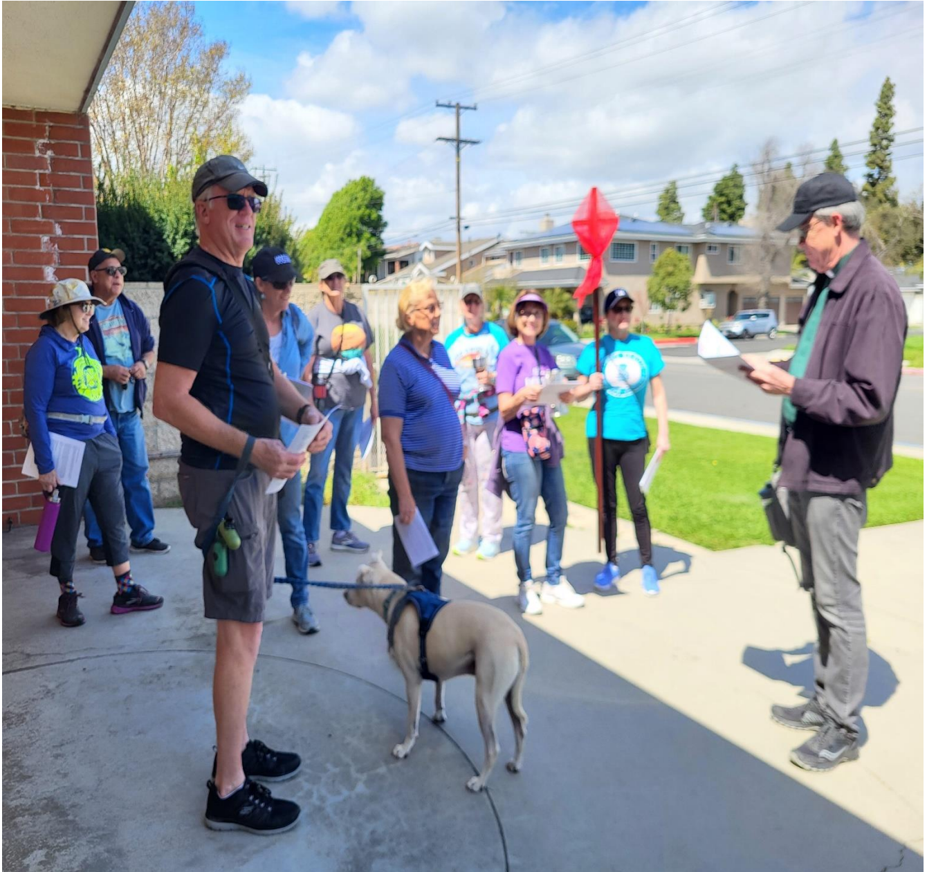
Stations of the Crosswalk