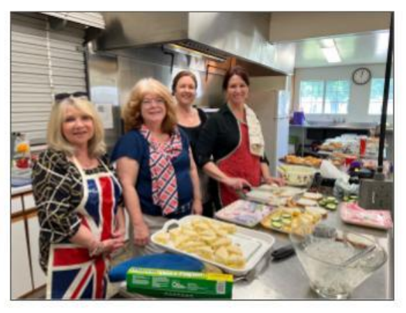
The Tea Committee.