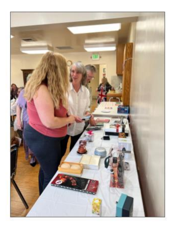
Everyone got a prize.