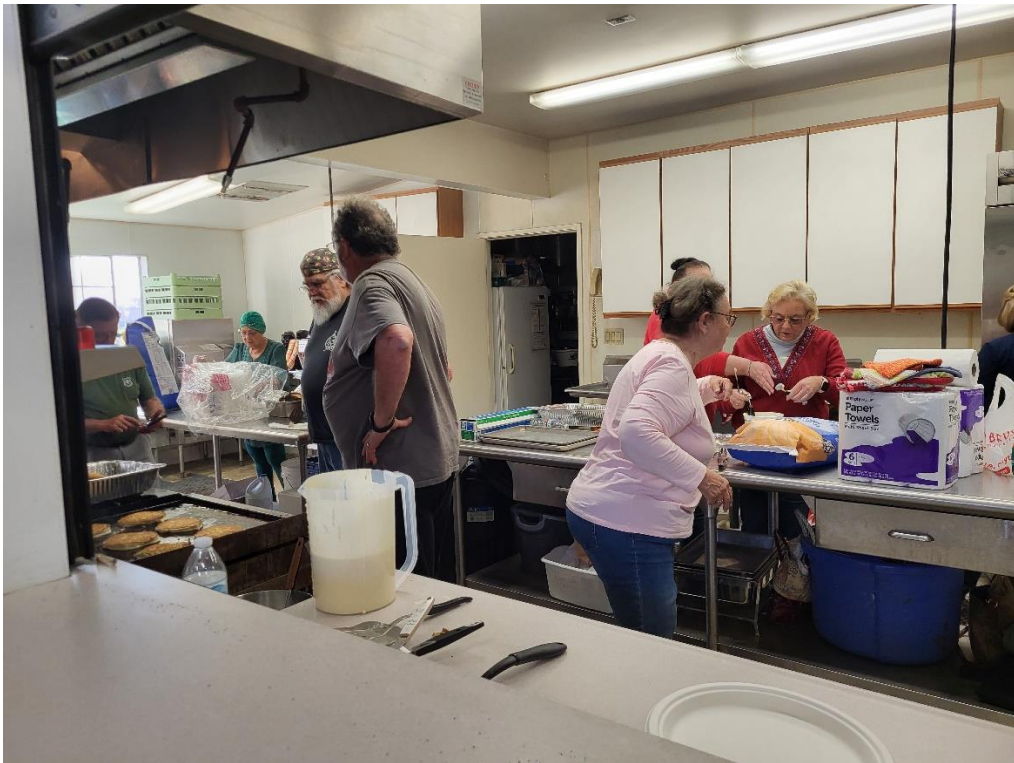
Part of the hardworking kitchen crew