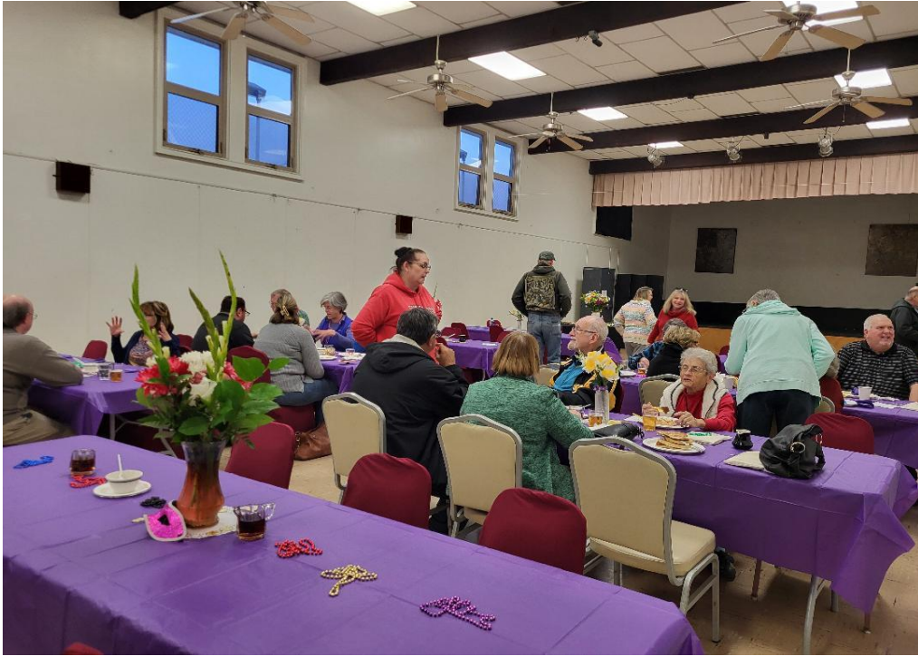
Everyone having fun